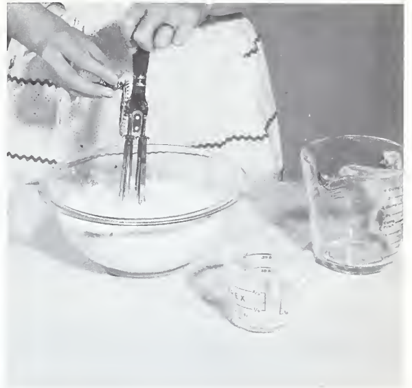
N -39860--Use beater to combine dry milk and water. Beat until blended.